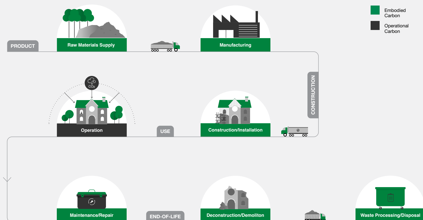
FIGURE 1 PRODUCT LIFE CYCLE

Our line of responsibly produced products are high quality and built to last, delivering long-term value for building professionals and homeowners, whilst helping builders to reduce the environmental impact of their builds.